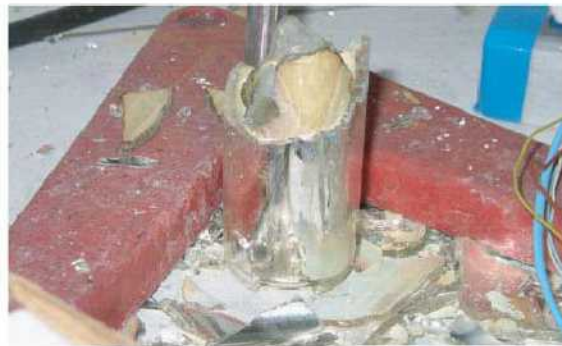
A Notional LENR Electrochemical Cell (Left) and a French LENR Apparatus After an Unexplained Explosion (Right) 54