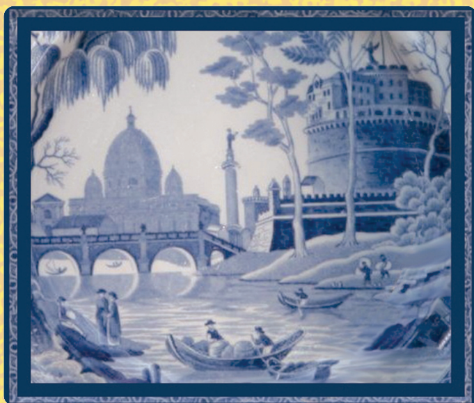
Historic view of Rome by Spode, 1811