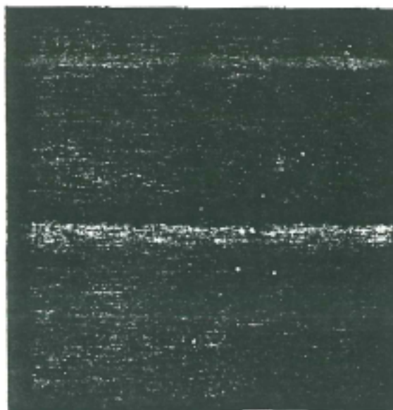
Fig.3. Typical Autoradiograph of a Deuterated Ti Disc Showing Regions of Tritium Concentration

Since tritium which emits betas of 18 Kev (end point energy) has been found to be the primary product of cold fusion, it may be expected that autoradiography of deuterated Ti targets may give very useful information in the form of space resolved images. Deuterated Ti targets in which cold fusion reactions were suspected to have occurred were placed over a standard medical X-ray film and exposed overnight. On developing, the radiographs of deuterated Ti discs showed about a dozen intense spots randomly distributed within the disc boundary, besides a large number of smaller spots, especially all along the periphery forming a neat ring of dots (see Fig.3). Repeated measurements with the same disc target with exposure times varying from 10 to 40 hours gave almost identical patterns of spots, indicating that the tritium containing regions were well entrenched in the face of the titanium lattice. Spectral analysis of the X-ray emissions from such targets using a Si(Li) detector clearly showed the characteristic K_{\alpha} (4.51 Kev) and K_{\beta} (4.931 Kev) peaks of titanium excited by the betas from tritium decay.