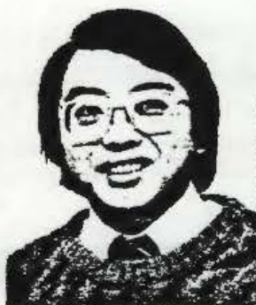
Hospital for Sick Children, Toronto

The search for the cystic fibrosis gene has been highly competitive, if not out-and-out contentious at times ( Science , 8 April 1988, p. 141, and 15 April 1988, p. 282). But in