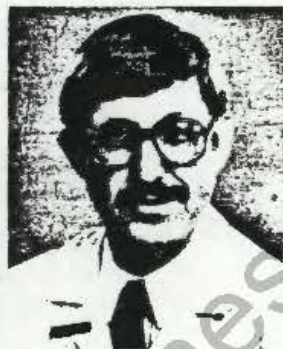
University of Michigan