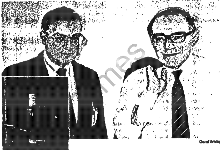
University of Utah

The fourth of these cells, which boiled for 11 minutes, was shown to the audience in time-lapse photography. If there were not a fusion reaction going on in this cell, which contained 2.5 moles of heavy water, then it should have taken 40 minutes or so for such a boil-off to occur under the nor-