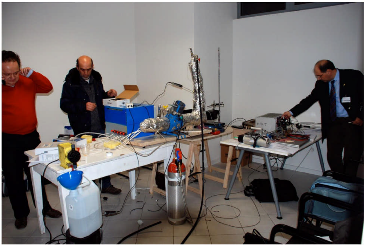
Figure 1 Preparing to disassemble equipment after experiment

There was also an input power meter that has not been identified or described in the information available to us at this time.